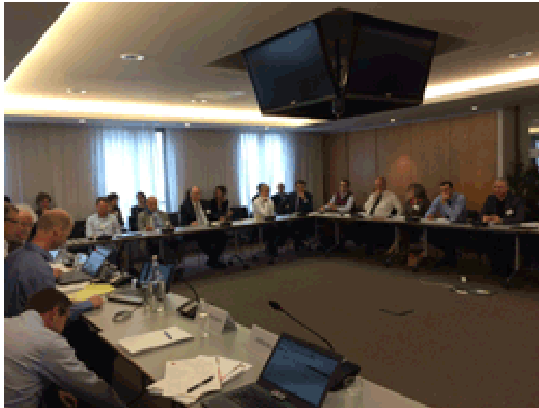
Participants of the SEEK-BRUEGEL Workshop

and was the final event of two cartel-related SEEK projects. The international research programme SEEK (Strengthening Efficiency and Competitiveness in the European Knowledge Economies) at the Centre for European Economic Research (ZEW) is funded by the State of Baden-Württemberg. Its objective is to conduct application-oriented analysis of the most pressing problems for European economic policy and it that aims to bolster international co-operation between researchers of all economic disciplines.